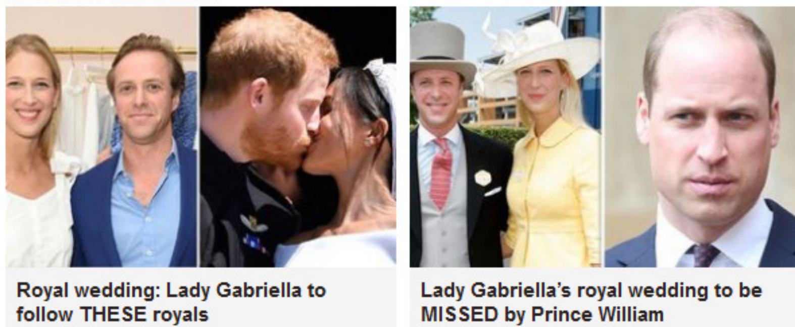
Royal wedding: Lady Gabriella to follow THESE royals