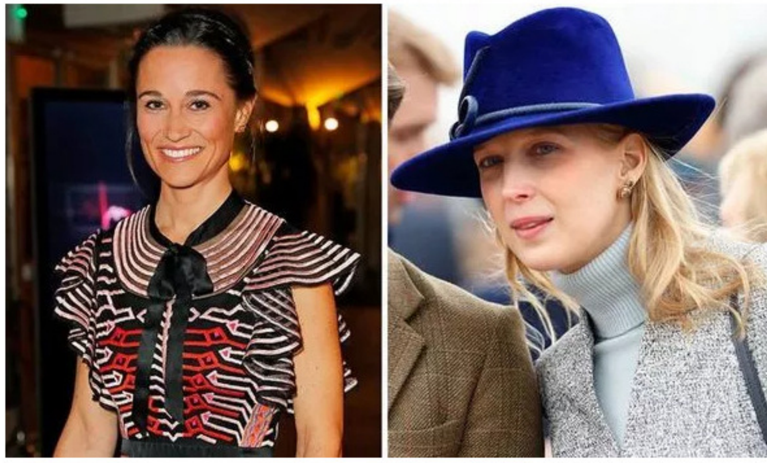
Royal wedding shock: The groom's ex Pippa Middleton is likely to attend the wedding